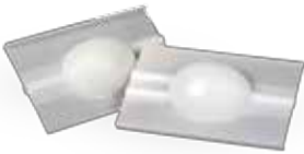
Microfluidic mixers printed in VisiJet SL Flex