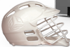
Helmet model printed in Accura Xtreme White 200