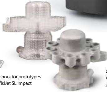
QuickCast® pattern in VisiJet SL Clear, and aluminum casting