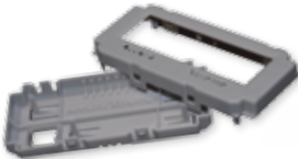
Electronic housing prototype printed in Accura Xtreme