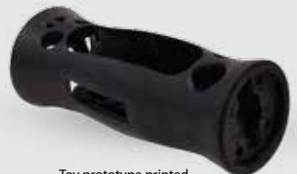
Toy prototype printed in Accura ABS Black

SLA printers are able to print highly detailed, tiny parts just a few mm in size, all the way up to 1.5 m long parts—all at the same exceptional resolution and accuracy. Even large parts remain highly accurate from end-to-end, with virtually no part shrink or warping.