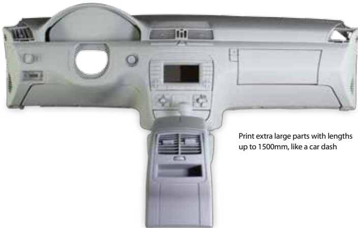
Print extra large parts with lengths up to 1500mm, like a car dash

3D Systems, the inventor of Stereolithography (SLA), brings you legendary precision in 3D printers, fine-tuned for cost-efficiency and unrivaled material availability. These advanced 3D printers produce exact plastic parts without the restrictions of CNC or injection molding. In addition to prototypes and end-use parts, these SLA printers create casting patterns, rapid tooling and fixtures. With speed, accuracy and surface quality of this level, you can produce low- to medium-run parts at a lower per-unit cost and build massive, highly-detailed pieces faster.