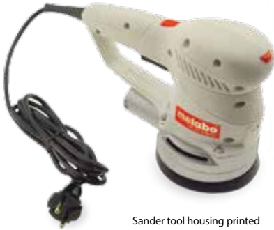
Sander tool housing printed in DuraForm PA material

The sPro SLS systems share a common architecture to produce high-resolution, durable thermoplastic parts available in medium to large build volumes.