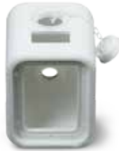
Housing for a laser sensor printed in DuraForm ProX PA