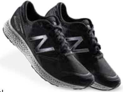
Production running shoe with midsole printed in DuraForm Flex TPU

* Availability varies by printer model (see details on the last page).