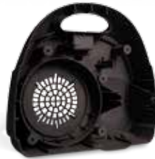
Back cover of vacuum cleaner printed in DuraForm EX Black